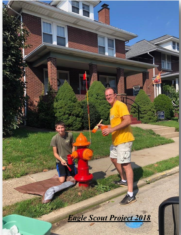
Eagle Scout Project 2018