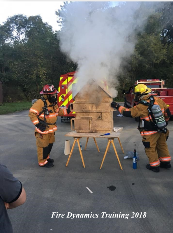
Fire Dynamics Training 2018