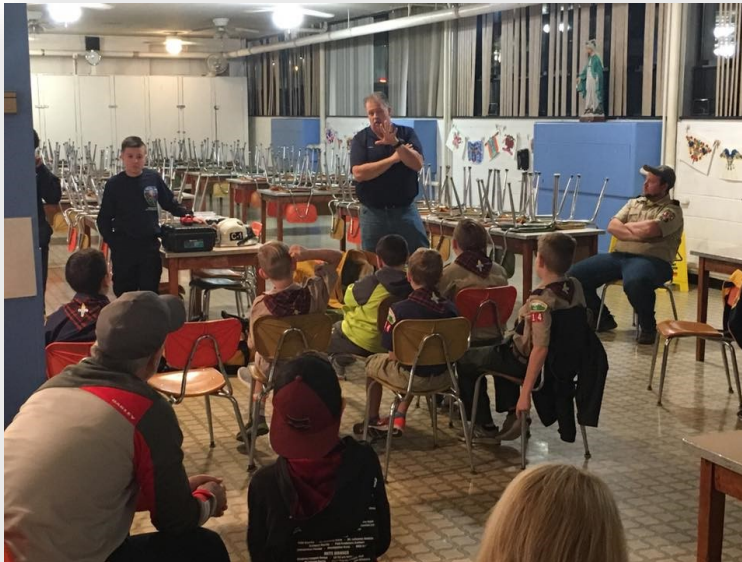
The Chief Hitting the Streets For the Future of the GVFD Talking with a Scout Group